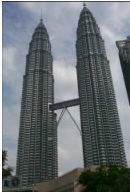
Kuala Lumpur's Petronas Towers – the tallest buildings in the world.

concrete that is three times stronger than normal concrete and twice as effective as steel in sway reduction was chosen. Each tower contains 2 million square feet of office space. The complex also contains an art gallery, an 840-seat concert hall and a prayer room called a surau. No one lives in the buildings.