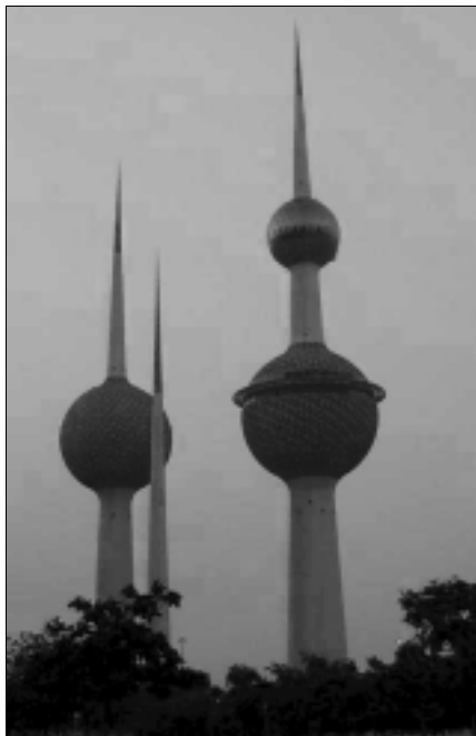
Famous "Towers of Kuwait" - the bulbous one on the left is a water tower containing 1, 000, 000 gallons of water.

KNPC is a state-owned company with roots back to 1934, when British Petroleum and the Gulf Oil Corporation of America formed an operating unit - the Kuwait Oil Company. By 1980, Kuwait's oil output was ranked seventh in the world. Oil revenues account for over 95% of the country's total income.