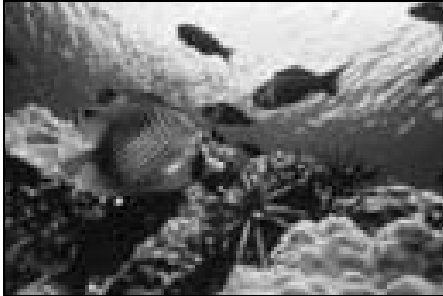
Scuba diving – one of the favorite past times

Aruba lies just 18 miles off the coast of Venezuela and 42 miles west of Curacao. The westernmost of the Caribbean islands, Aruba covers an area of 70 square miles, 20 miles at its longest and 6 miles at its widest. Approximately 81,000 people reside in Aruba full time but more than 540,000 people visit during the course of a year.