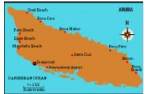
Map of the Island

Exxon, through the acquisition of Standard Oil assets, acquired the Lago Refinery but it was closed in 1985. However, in 1989, an agreement between the government of Aruba and Coastal Corporation of