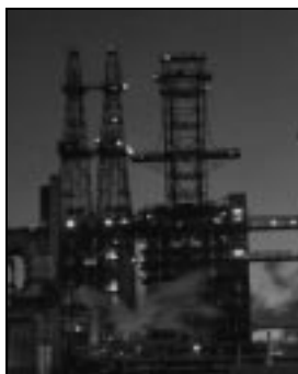
A familiar site - coker at night fall

CIA Inspection provides a remote coke drum inspection service that inspects the interior of delayed coke drums without requiring blinding or scaffolding. Our service includes a